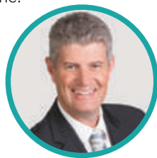
The Hon. Stirling Hinchliffe MP Minister for Tourism Industry Development and Innovation and Minister for Sport

If you are visiting for the event, I encourage you to make some time to explore the diverse tourism experiences on offer in this beautiful region.